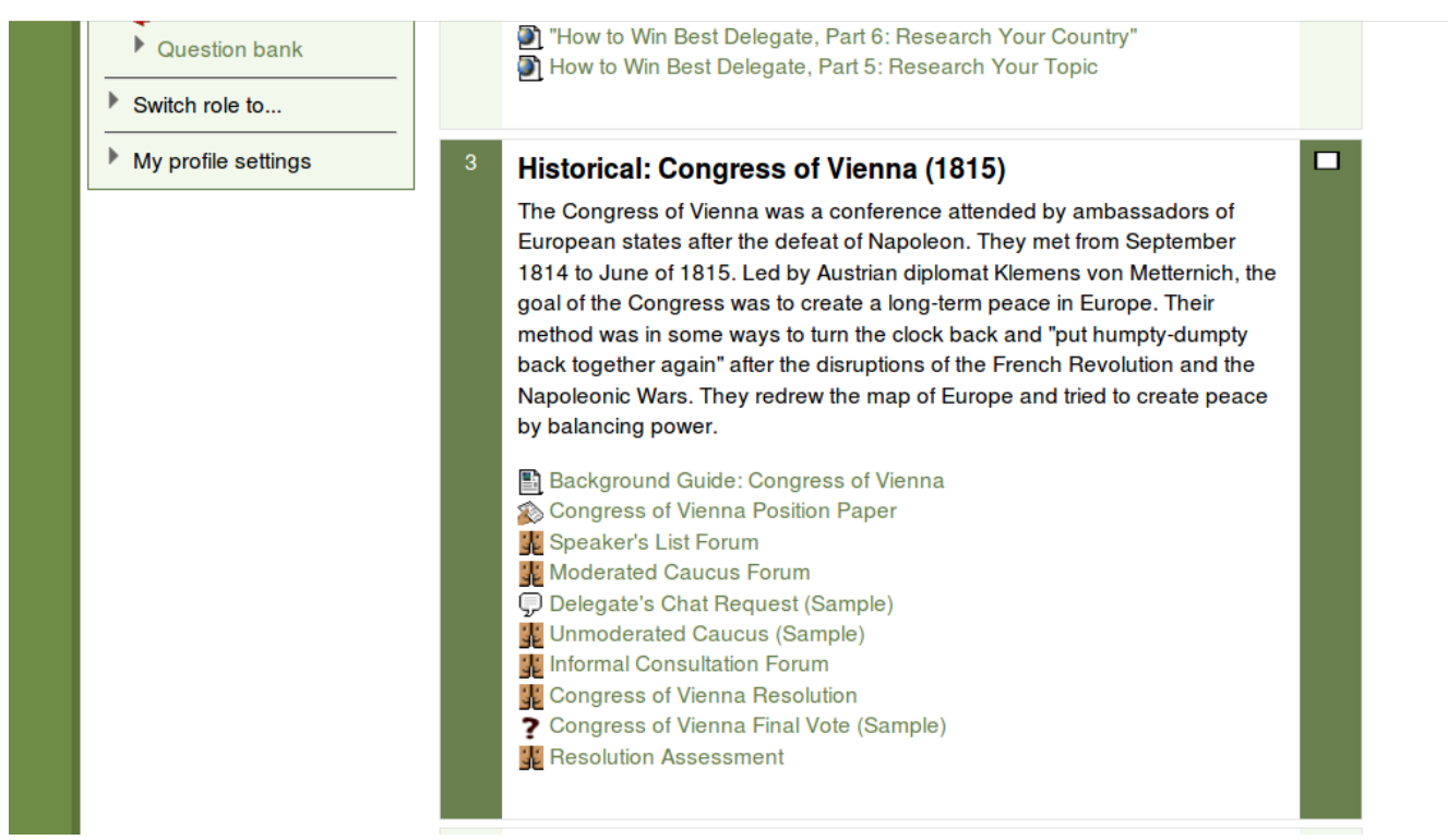
Screenshot of the Moodle interface for the pilot test

In consideration of accessibility, the LMS "Moodle" is an open-source project that by virtue of that fact has evolved a highly accessible nature. Among the principle of accessible design suggested by Introduction to Web Accessibility that are found built in to the LMS are: provide appropriate alternative text, provide appropriate document structure, provide headers for data tables, ensure users can complete and submit all forms, ensure links make sense out of context, ability for me to caption and/or provide transcripts for media, will not rely on color alone to convey meaning, allows me to make sure content is clearly written and easy to read, and the web site will be designed to HTML compliant standards. The principle of straightforward consistency supports accessibility considerations in particular for people with cognitive disability types (Introduction to Web Accessibility).